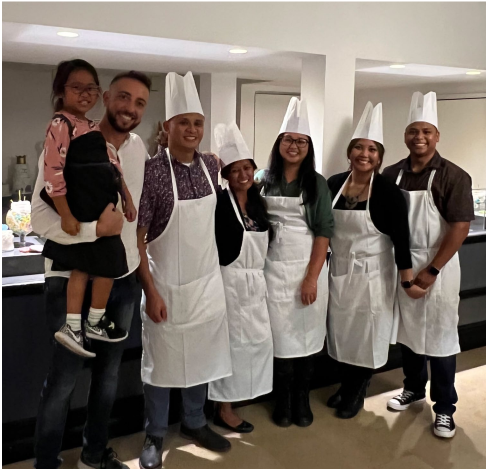
Private event - Make your own authentic pasta

Italy is a country steeped in history, culture, and delicious food. It's no wonder that so many people dream of visiting this beautiful country at least once in their lifetime.