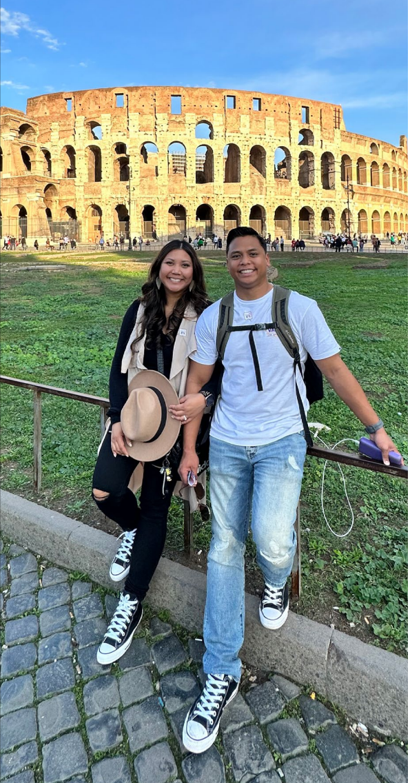
The Coliseum, Rome