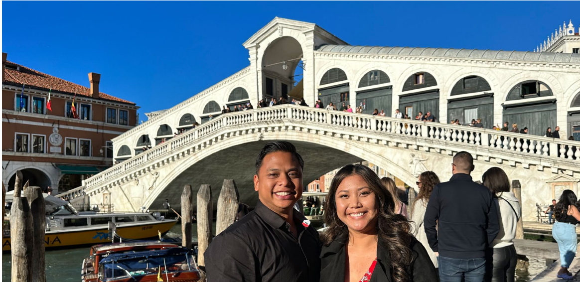
Rialto Bridge, Venice

Next, we took a 2-hour train ride to Venice, which quickly became my favorite city. It's a unique and charming place with no roads, so we traveled by water taxi and walking. We saw the famous Rialto Bridge and tried the squid pasta, which was absolutely delicious. Our hotel had a beautiful balcony with a view of the water, making our stay even more memorable.